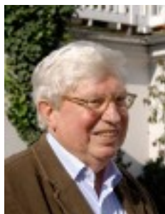
Gerhard ERTL - the Nobel Prize Winner in Chemistry 2007

Fritz-Haber-Institut der Max-Planck-Gesellschaft, Berlin, DE